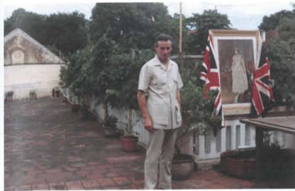
Staff of the CG's Residence