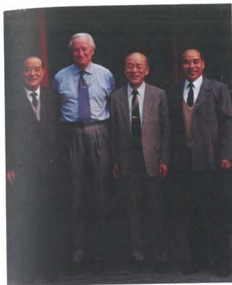
Central Committee School