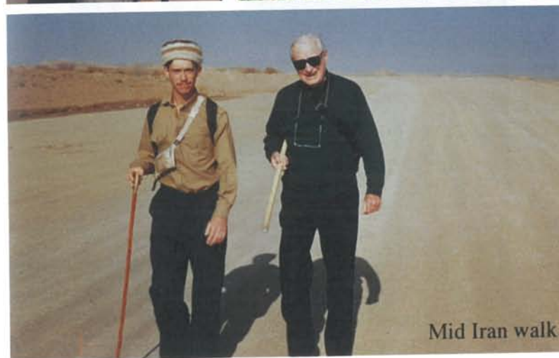
Mid Iran walk