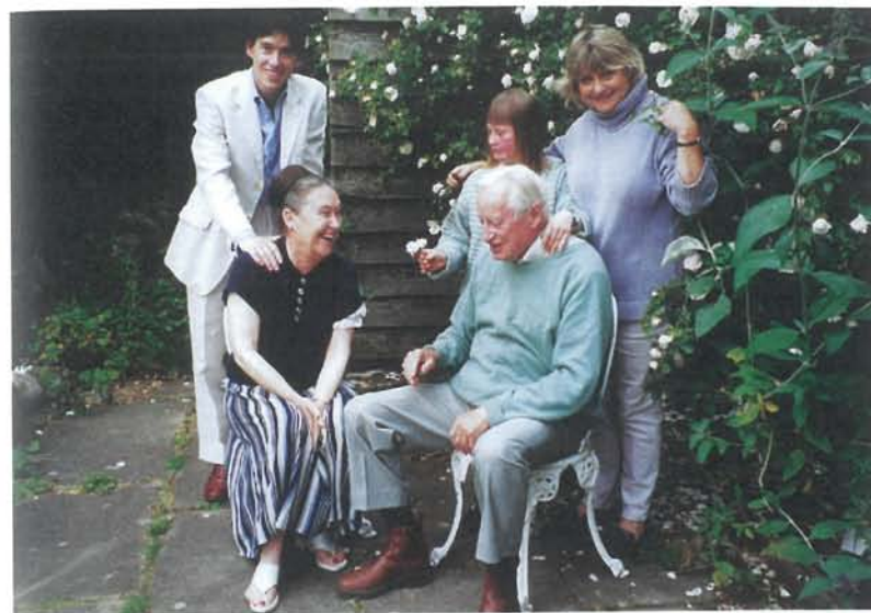
The whole family, 2006