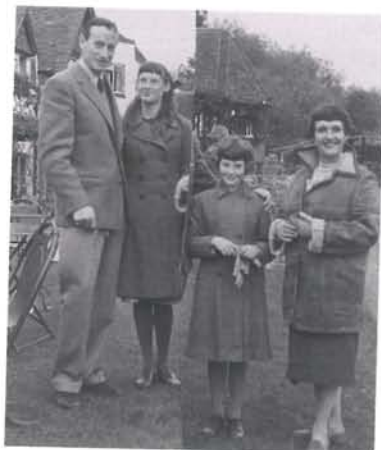
Two little angels from their Convent School