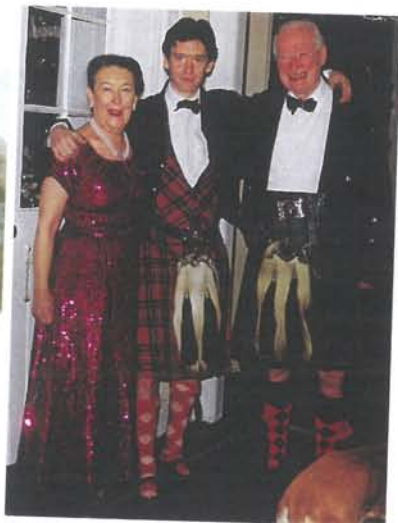
Off to the Ball