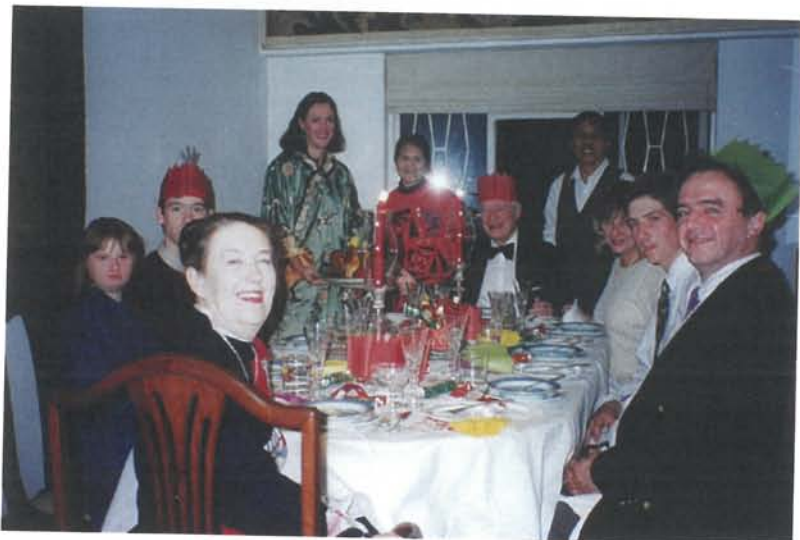
The whole family in Hong Kong for Christmas

American Imperialists, foreign spy!" Nien was a prime target for any revolutionary witch hunters. She was an aristocrat, appreciated Tang poetry; collected Ming paintings and her jade and porcelain were superb. Her whole lifestyle was unsuitable for China in 1961, but she had stayed on in China to look after her beloved daughter Mei Ping. Now she was the victim of the Cultural Revolution, China's worst convulsion since 1949. For the next seven years she paid a terrible penalty; solitary confinement, miserable conditions, poor health and brutality. She survived with unbelievable courage and her indomitable will unbroken.