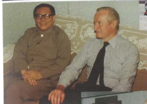
With President Jiang Zemin