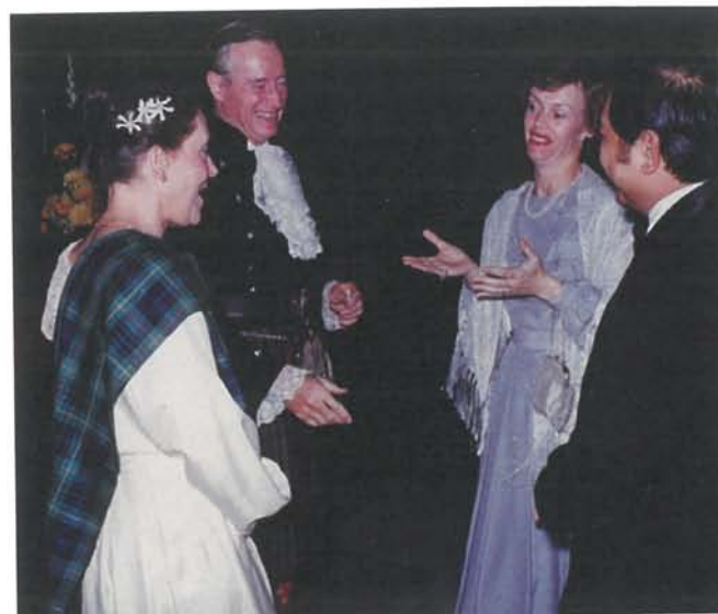
Chieftain greeting Minister at St Andrew's Ball