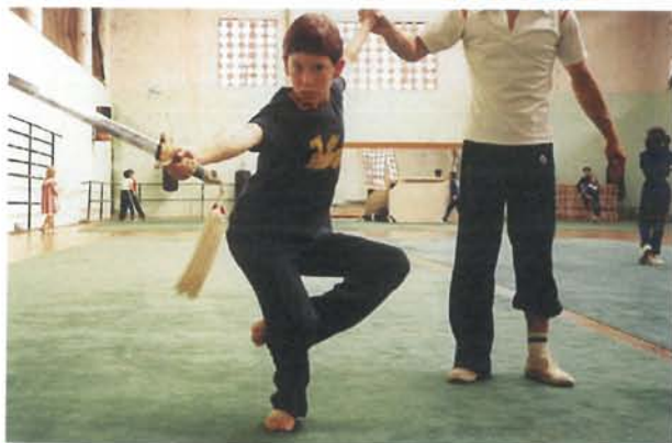
Martial Arts in Kunming