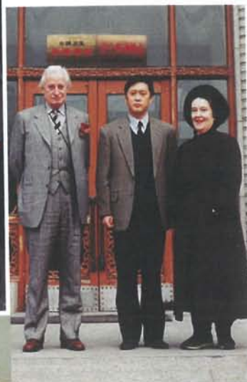
Farewell to China