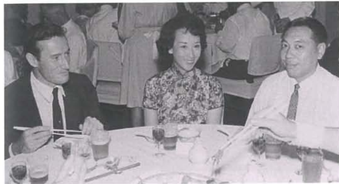
Nien Cheng at a Banquet