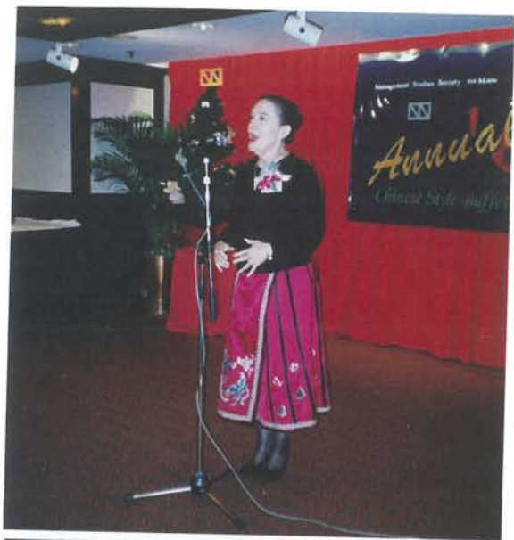
Whose Business Values?